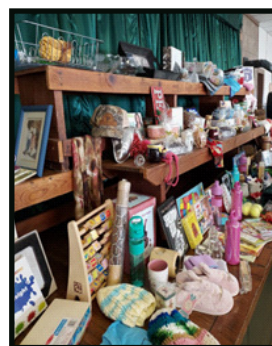
Some of the many Bingo prizes