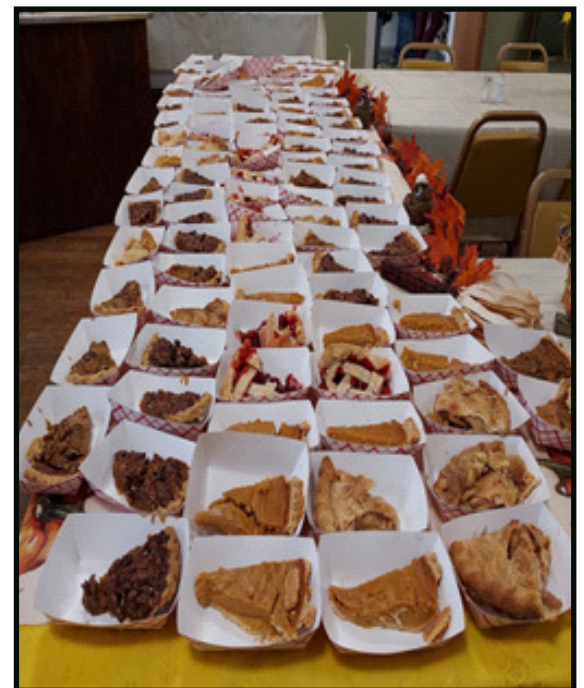
A few of the many pieces of pie