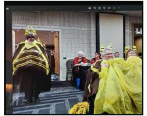
Gems from #13 doing a skit about Loving, Caring Bee Sisters