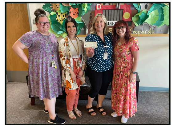
Lake Ridge teachers receiving the check for the books!

Nampa Lodge #40 presented a check to Lake Ridge from the Christmas Party of 2022. Those who attended, your donation to this project allowed Lake Ridge Elementary to purchase a book for every Kindergarten, 1st and 2nd grader a book of their very own. Lake Ridge sends the appreciation for supporting this project.