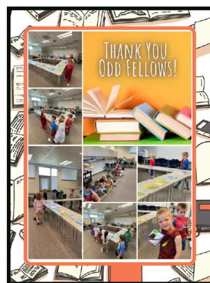
Lake Ridge students choosing their books.