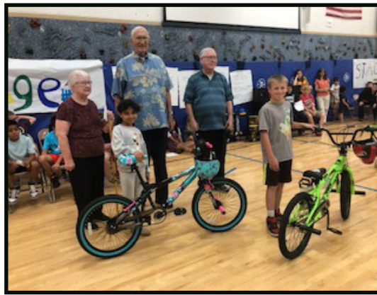
Melba Elementary winners