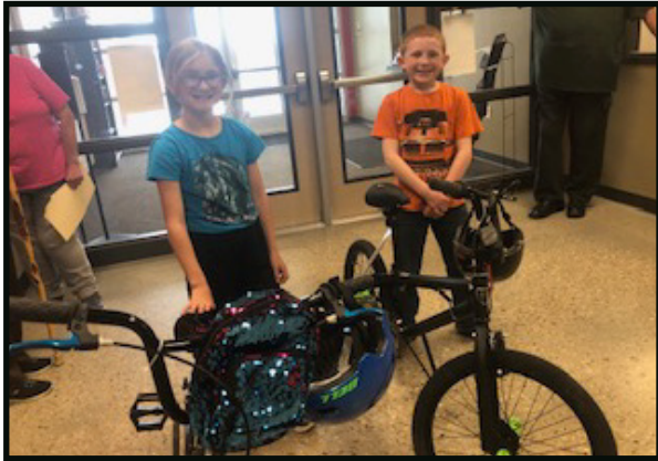
Greenhurst Bike Winners