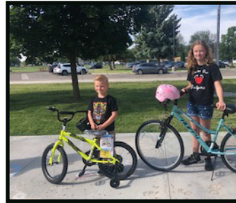
The Centennial Elementary happy winners of the Books-for-Bikes program