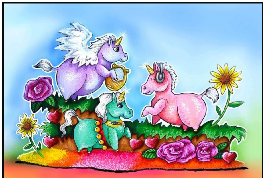
2024 Rose Parade theme: Celebration of music. IOOF Float theme. All we need is love

What some Odd Fellows/Rebekah members do when they are not doing Lodge work.