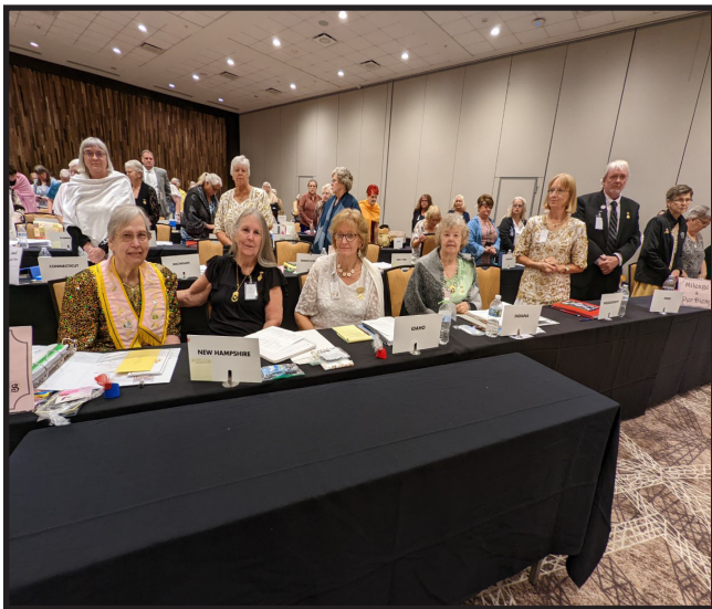
Busy with Committe Stuff