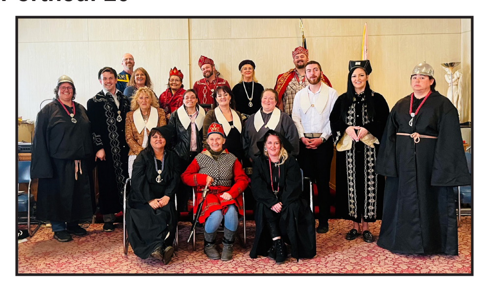
All of the present members of Portneuf including new ones

Pocatello - It was Portneuf #20's privilege to hold the 2022 District Meeting for District 1 on March 26th. We did not have a large turn out, but it was amazing fun. We had great messages given and received. We are looking forward to next years District Meeting for District 1 being held in Ashton.