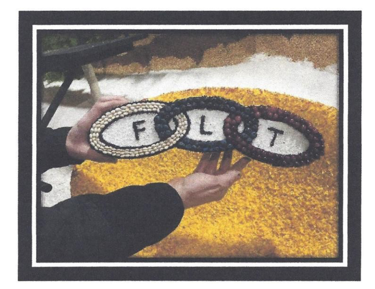
The three-links were made of beans, blueberries and cranberries on a powdered rice background.