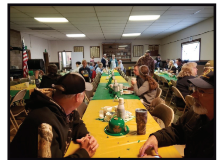
Folks enjoying their breakfast with friends