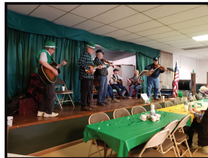
The Old Time Fiddlers entertained the crowd