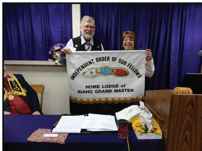
Exchange of the Grand Master Banner