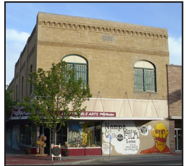
Nampa Lodge #40 & Colfax #24