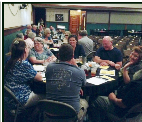
Members & Family

Glenns Ferry - In July, members, along with family, attended the Glenns Ferry Opera Theater. In lieu of a summer picnic, the members of the Mountain Home lodges have opted to attend the historic theater in Glenns Ferry; where the food is good, the atmosphere is wonderful and the plays are great.