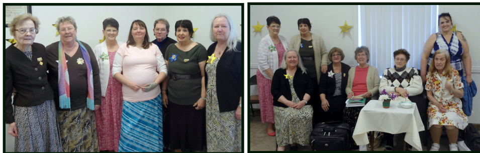
Bingham #78 with New Member Progress #48 with New Member