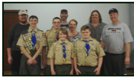
Boy Scout #320

Pocatello - On March 17, 2016 the officers and members of Ivy Rebekah Lodge were served a delicious Salmon dinner that was prepared and served by Boy Scout Troop #320 that is sponsored by Ivy Rebekah Lodge #23 and Portneuf Odd Fellows Lodge #20. The meal was delicious and the Boy Scouts received a well done from all present.